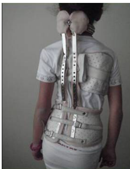
Figure 1. Cervicothoracolumbosacral scoliosis ortesis (Milwakuue brace)